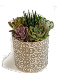
4.5" Grey Tile