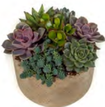
6.5" Hypertufa Cement