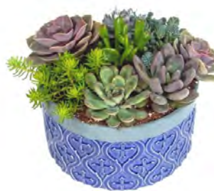
Blue Embossed 6.5" $14.00 each