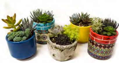
Assorted 2.5" Combos $4.50 each