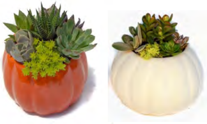
6" Orange & 6.5" White Pumpkins