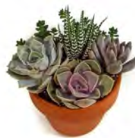
4" Clay Combo