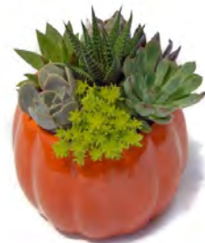
4.5" Ceramic Pumpkin