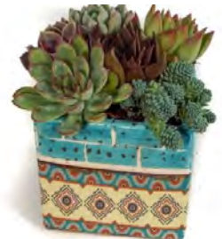
Barcelona Square 4" $10.00 each