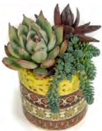
Barcelona Round 2.25" $4.50 each