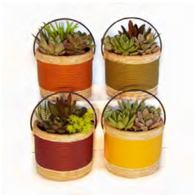
4" Hazel Planter