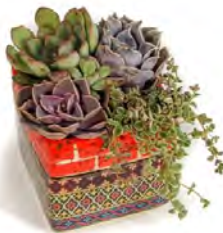
Barcelona Square 3" $6.00 each