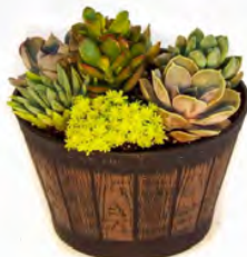
6" Whiskey Barrel