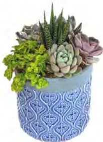
Blue Embossed 4.5" $9.50 each

Barcelona Combo Half Shelf - 12 Round, 12 Square 3", and 8 Square 4"