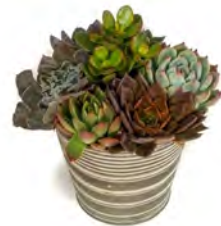
4" Vintage Tin