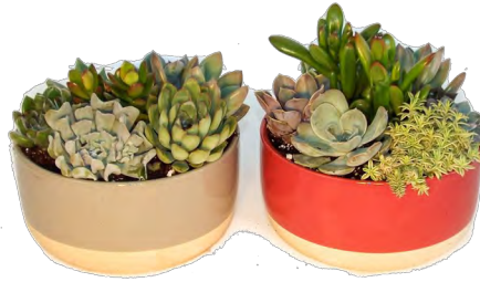
Bicolor Nidos Bowl 7" $18.00 each