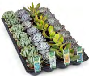
2" Assorted Succulents