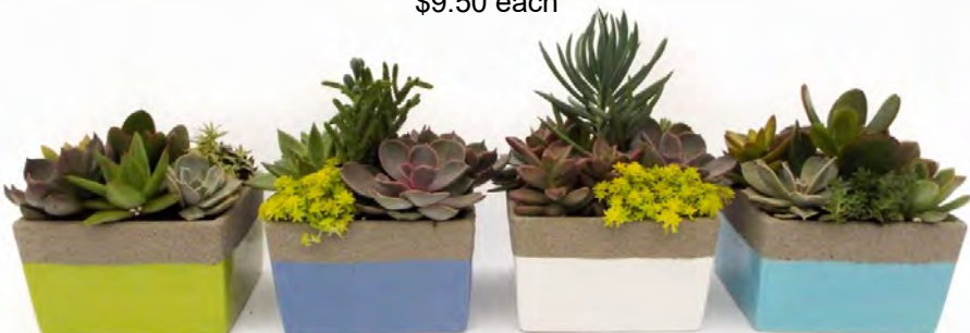
Creekside Square 5" $9.50 each