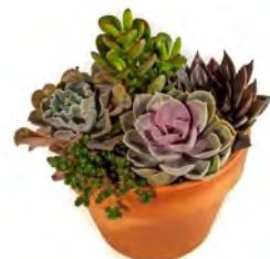
6" Clay Combo