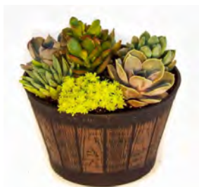
6" Whiskey Barrel