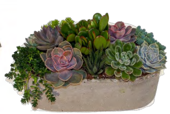
Hypertufa Cement 4.5", 6.5", and 12" Trough