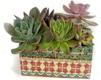
Barcelona Rectangle $10.75 each - 5.5" x 3"