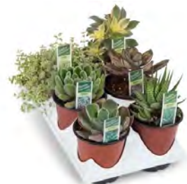
3.5" Assorted Succulents